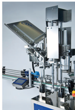
Capsule dispenser and crimper - motorized height regulation