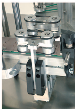
Automatic bottle hold and centring system

Control of the machine by digital display with bottle dressing