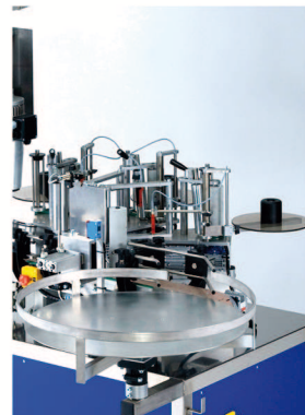
Rotating bottle accumulation table