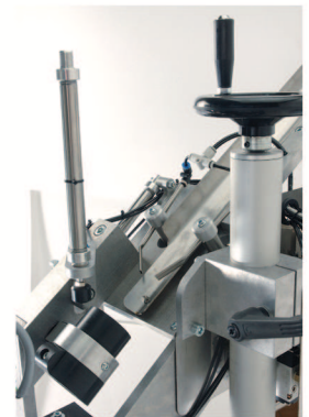
Capsule dispenser height setting by crank