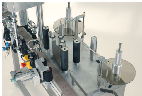
Labeling station for front and back labels on the same roll or on two different rolls