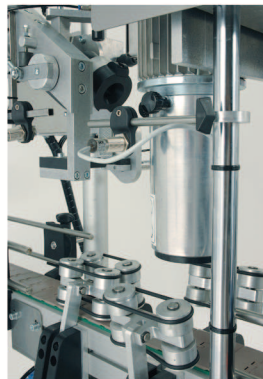
Crimping station with a new generation crimper

Machine conceived without star or screw which allows any type of cylindrical bottles